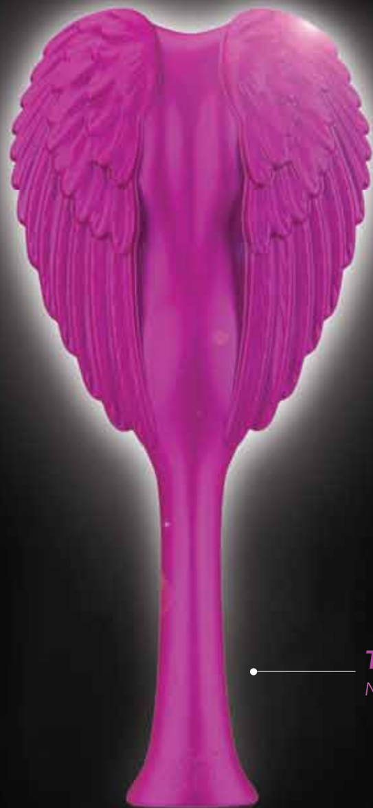
• Tangle Angel Xtreme New - Fuchsia soft touch - page 8