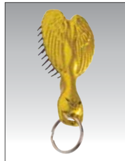
GORGEOUS GOLD - TAB005