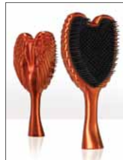
OMG ORANGE - TA007