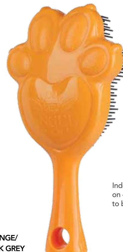
ORANGE/ DARK GREY