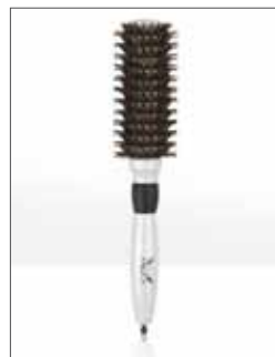
53mm SMALL - SA003