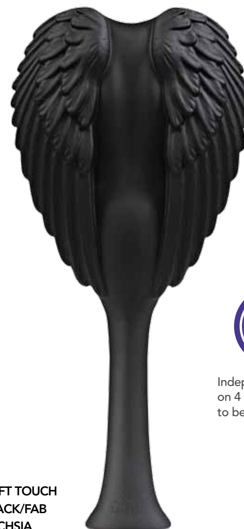
SOFT TOUCH BLACK/FAB FUCHSIA