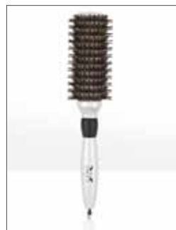
60mm MEDIUM - SA002