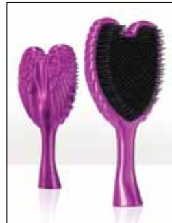
FAB FUCHSIA - TA006