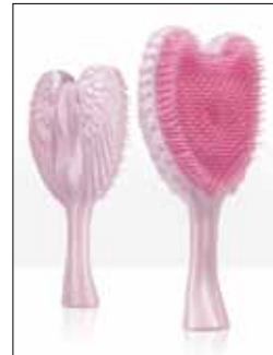
PRECIOUS PINK - TA001