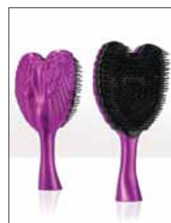
FAB FUCHSIA - TC003