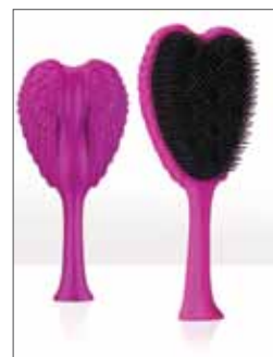
SOFT TOUCH FAB FUCHSIA /BLACK - TAX001