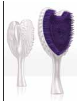
WOW WHITE - TA002