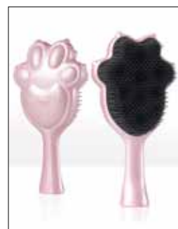
PEARL PINK - PA002