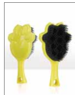
ZESTY YELLOW - PAM002