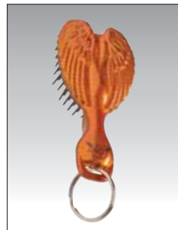
OMG ORANGE - TAB004