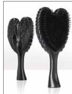
GR8 GRAPHITE - TA003