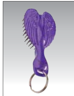
POP PURPLE - TAB002