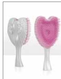
WOW WHITE - TC001

I bought Tangle Cherub for my 5 year old daughter. Hair brushing is always a battleground, but with Tangle Cherub , she wants to brush her own hair, and there are no 'ouches'. I like the fact that it has a proper handle which makes it more manageable for smaller hands. It's a triumph in my eyes, and my daughters!