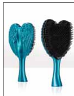
TOTALLY TURQUOISE - TC004

The contoured base retains full bristle height with no reduction in performance once hair is detangled