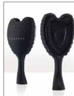
SOFT TOUCH BLACK/BLACK - TAC001

The ergonomically shaped smooth brush back allows you to hold it for greater control when styling