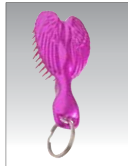
FAB FUCHSIA - TAB003