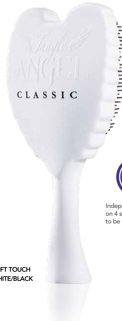
SOFT TOUCH WHITE/BLACK