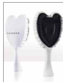
SOFT TOUCH WHITE/BLACK - TAC002