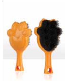
ORANGE - PAM003