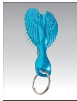
TOTALLY TURQUOISE - TAB001