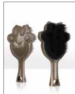
BRONZE - PAM004