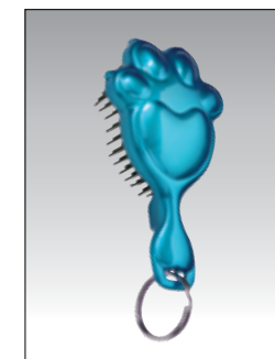
TOTALLY TURQUOISE - TAB001