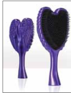
POP PURPLE - TA005