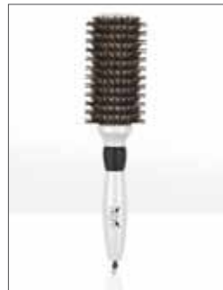
70mm LARGE - SA001