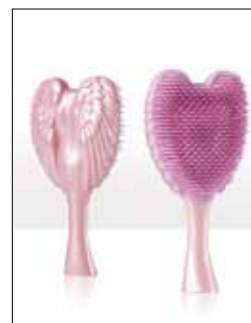
PRECIOUS PINK - TC002