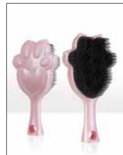
PEARL PINK - PAM005