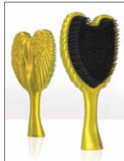
GORGEOUS GOLD - TA008