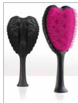
SOFT TOUCH BLACK/FAB FUCHSIA - TAX002