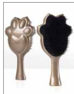
BRONZE - PA001