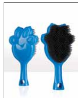
ELECTRIC BLUE - PAM001