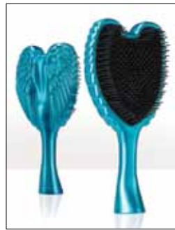
TOTALLY TURQUOISE - TA004